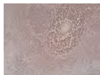
[IHC] Rat spleen tissue

Raised in GANP® mouse Myeloma P3UI Clone number 2D5 Purification ProteinG Source Serum-free medium Isotype IgG1,k Cross Reactivity Rat Label Unlabeled Concentration 0.25 mg/mL Contents (Volume) 50 µg (200 µL/vial) Buffer PBS [containing 2% Block Ace as a stabilizer, 0.1% Proclin as a bacteriostat] Storage Store below -20°C. Once thawed, store at 4°C. Repeated freeze-thaw cycles should be avoided.