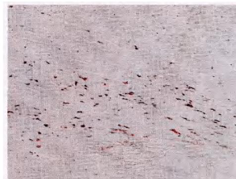
Immunohistochemical staining of the early stage of human atherosclerotic lesions of the aorta with anti-AGEs antibody 6D12.

Clinical nephrology , Vol.42, 354-361, 1994