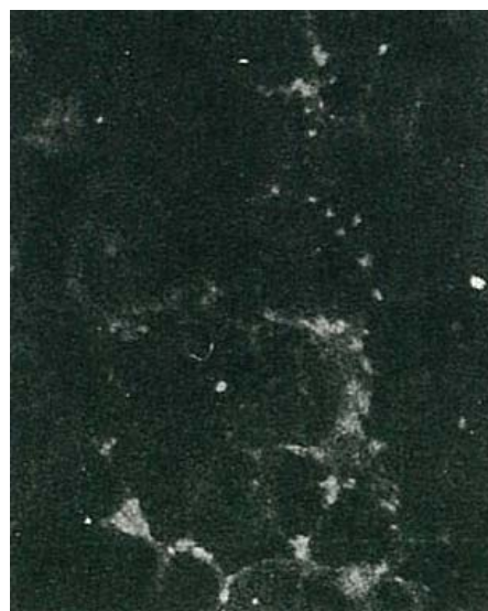
Fig.2 Detection of HCV NS5b protein by immunofluorescence antibody staining. Chimp liver cells were infected with recombinant vaccinia virus containing a HCV genome cDNA. After incubation for 48 hr, the cells were fixed with acetone and HCV NS5b protein was detected by indirect immunofluorescence staining using this antibody.