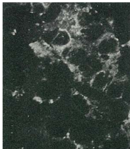
Fig.2 Detection of HCV NS4a protein by immunofluorescence antibody staining. Chimp liver cells were infected with recombinant vaccinia virus containing a HCV genome cDNA. After incubation for 48 hr, the cells were fixed with acetone and HCV NS4a protein was detected by indirect immunofluorescence staining using this antibody.