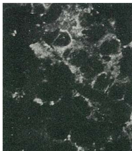
Fig.2 Detection of HCV NS4a protein by immunofluorescence antibody staining. Chimp liver cells were infected with recombinant vaccinia virus containing a HCV genome cDNA. After incubation for 48 hr, the cells were fixed with acetone and HCV NS4a protein was detected by indirect immunofluorescence staining using this antibody.