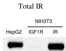
Figure 2. Immunoprecipitation/Western blot detection of Total IR in HepG2 cell lysate. HepG2 cells, NIH3T3 cells overexpressing human IGF1R (NIH3T3/IGF1R) or human IR (NIH3T3/IR) were grown to confluence. 100 µg of HepG2, 20 µg of NIH3T3/IGF1R or NIH3T3/IR cell lysates (lysed in MILLIPLEX MAP Lysis Buffer with protease inhibitors) were mixed with capture antibody beads to immunoprecipitate total IR protein from non-treated cell lysates. The immunoprecipitated proteins were separated on SDS-PAGE, transferred to nitrocellulose, and probed with biotin labeled total IR reporter antibody. The proteins were imaged using Streptavidin-HRP and chemiluminescence