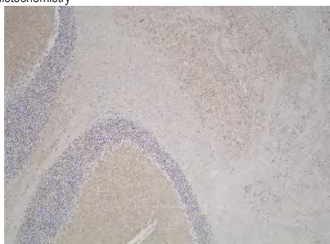
Sample : Mouse cerebellum (paraffin section)